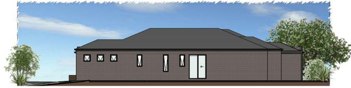
1 North-East Elevation SK-02 1 : 200