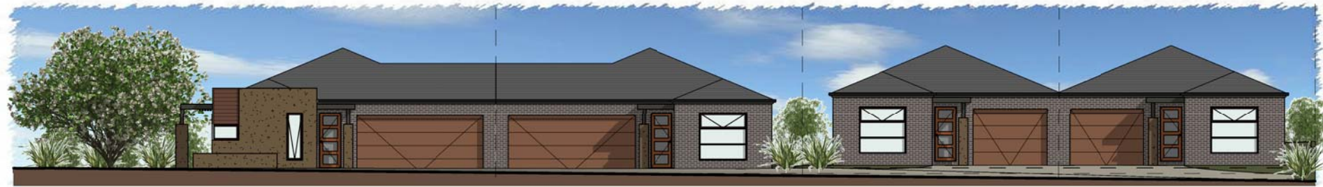
3 South-East Elevation SK-02 1 : 200