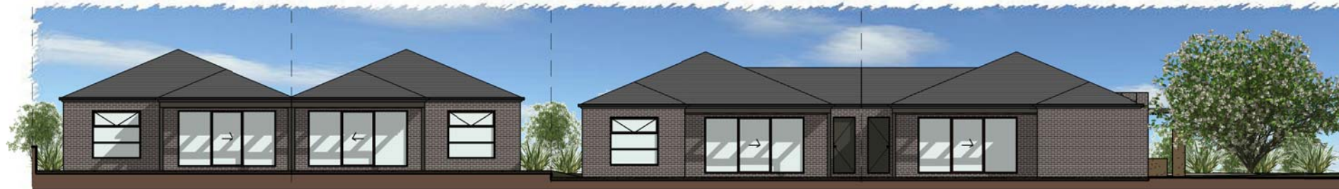
2 North-West Elevation SK-02 1 : 200