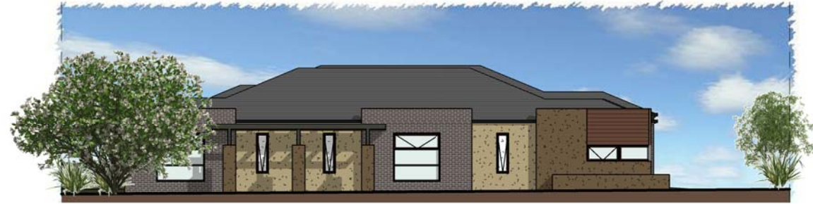
4 South-West Elevation SK-02 1 : 200